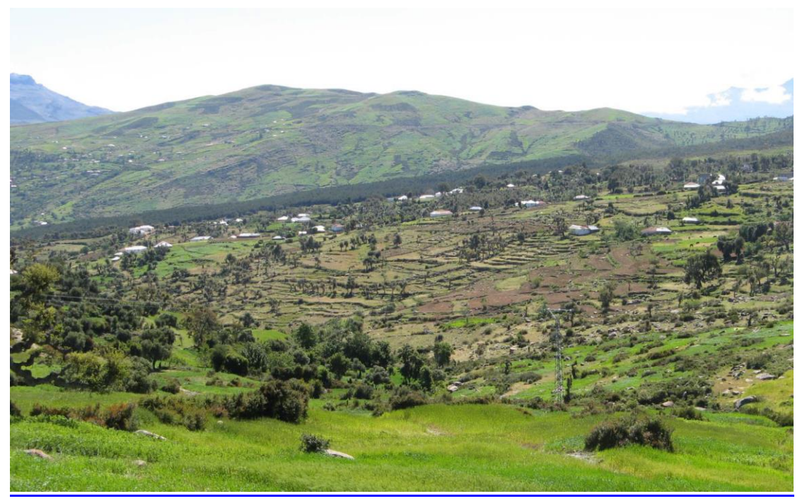
Fig. 1. Traditional landscape of Tayenza village in Oued El Kebir Watershed.

Oued el Kebir Watershed is located in the mountainous area of Tangier-Tetouan Region (Upper Martil Watershed, NW Morocco). Historically populated by Jbala tribes, the Tangier-Tetouan Region has about 3 million inhabitants and a surface area of 1,258km<sup>2</sup>. Three types of landscapes can be distinguished in this region: the coastal and urbanized areas, the Atlantic plains and hill areas and the higher mountainous areas. This case study is situated in the mountain areas and was selected as a pilot area for encompassing several common features with other mountainous landscapes in North Africa (Rif and Middle Atlas in Morocco, Tell in Algeria, Kroumirie in Tunisia).